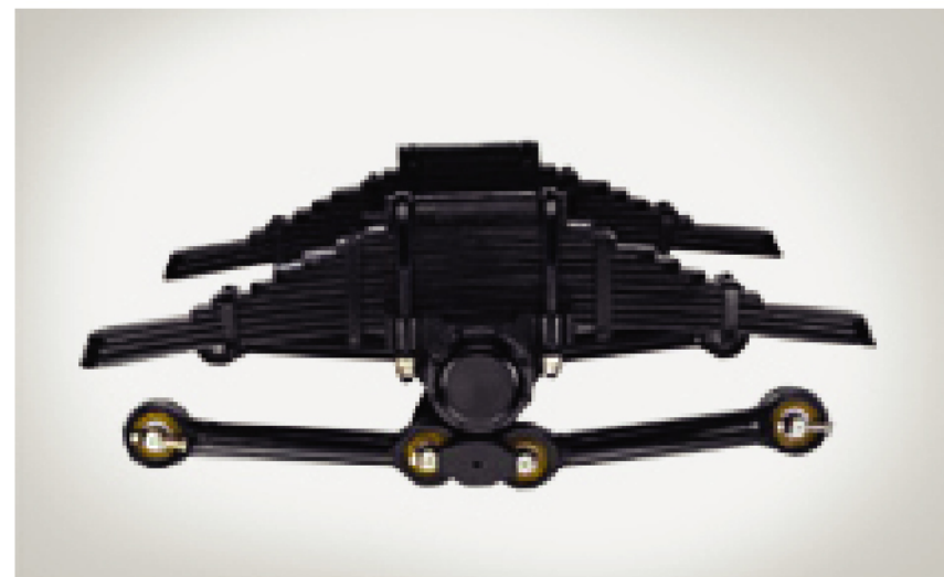
Main Rear Suspension