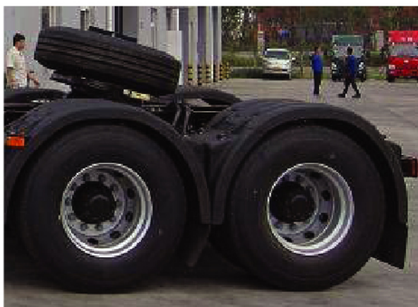
Full cover mud guard