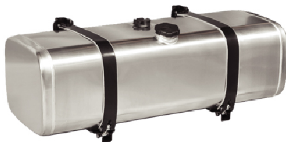
Stainless Steel Fuel Tank Capacity-500L