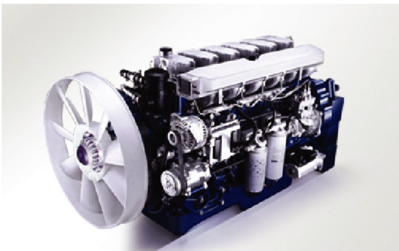
WP10380E32 Weichai Engine