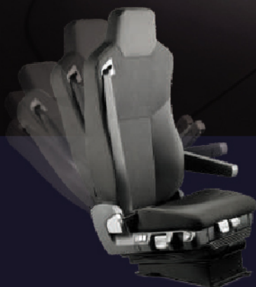
Air Suspension Adjustable Seat