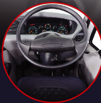
Adjustable Power Assisted Steering